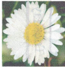
Daisy & Sweet Pea